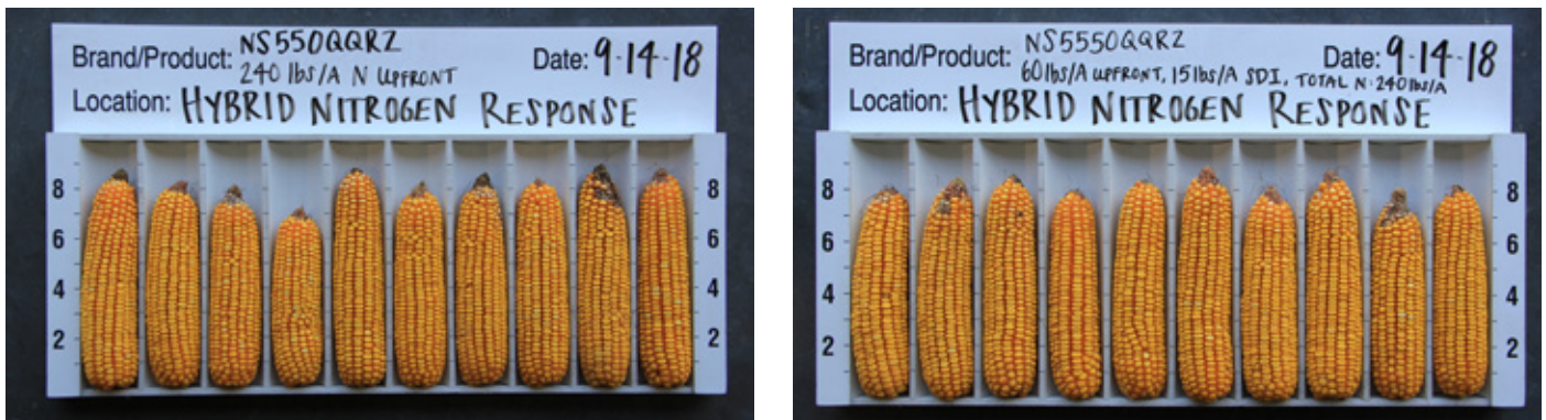
Figure 2. Representative cobs from the all-upfront treatment (left) and the fertigation treatment (right) for the 105RM-B product.