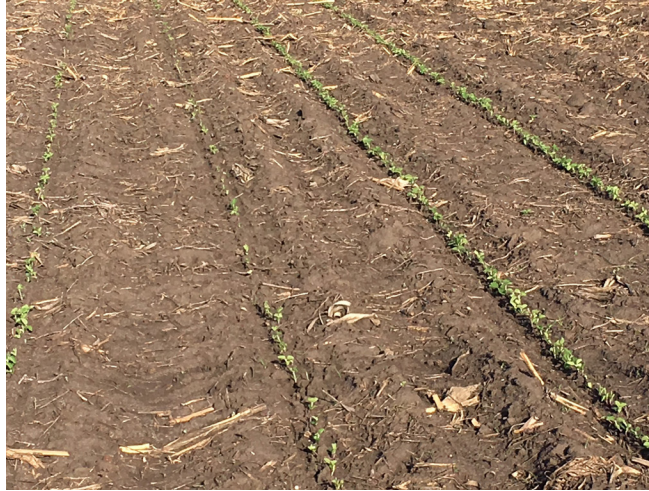
Figure 2. The two rows on the left are untreated, the two rows on the right are treated with Acceleron® Seed Applied Solutions STANDARD.