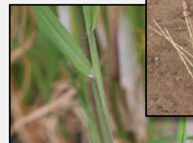
Large Crabgrass (ligule left, seedhead right)