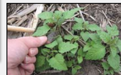
Eastern Black Nightshade