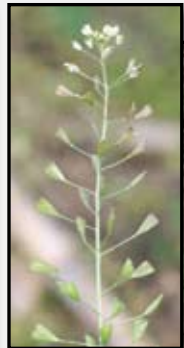
Shepherdspurse (rosette right, seedhead left)