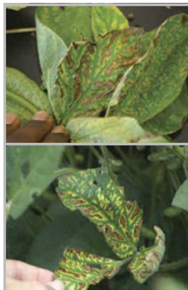
Figure 2. Foliar symptoms of brown stem rot (top) and sudden death syndrome (bottom) can be very similar.

Sudden Death Syndrome (SDS) is caused by Fusarium virguliforme . SDS is found across all soybean production regions and can be associated with compacted soil. The fungus infects the roots and the base of the stem, sending toxins to the leaves. Unlike BSR, symptoms of SDS may be seen during the vegetative growth stages. However, they are most commonly seen during the early reproductive growth stages through pod fill. Splitting the stem of a soybean plant infected with SDS will reveal a slightly tan to light brown discoloration of the cortex and a normal white to cream colored pith (Figure 4). This distinguishes the two diseases because soybean plants infected with BSR have a reddish-brown discolored pith. Two other symptoms only SDS can cause are root rot and blue masses of spores, which may be present on the tap root under moist conditions (Figure 5).