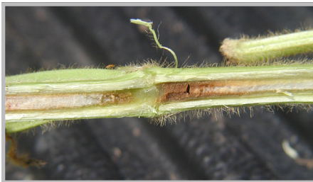
◀ Figure 3. Stem infected with BSR, discoloration of the central portion of the stem or pith (top) and a normal, healthy soybean stem (bottom).