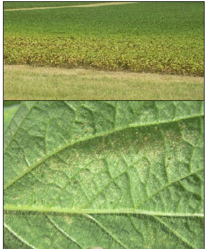
Figure 1. Spider mite injury on a soybean field edge (Above). Spider mites are sometimes visible on the underside of soybean leaves (Below).

Recognizing the speckling or stippling effect on the lower leaves